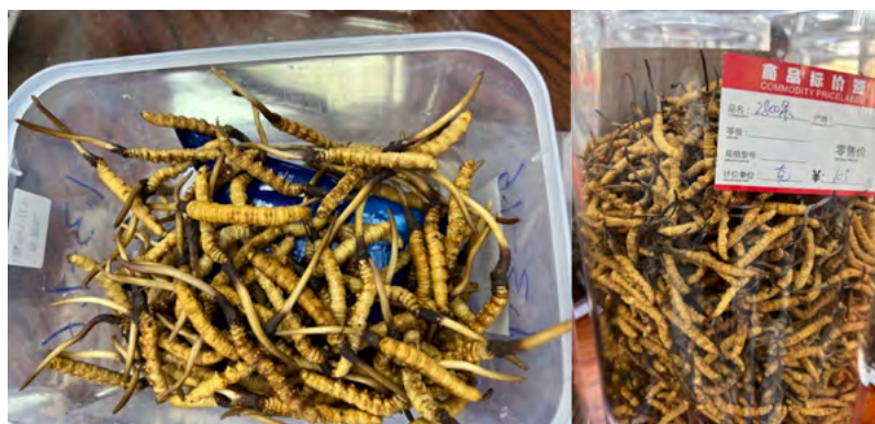
Figure 2. Cultivated cordyceps ( Ophiocordyceps sinensis ), fresh (left), dried and ready for sale (right).

2.1 Importance in trade: The markets for cordyceps in Asia and in other parts of the world are distinctly different. The main market for wild cordyceps is China, where it is used as traditional medicine but also frequently offered as a luxury gift. Wild cordyceps is also popular in other East Asian countries such as Japan and Korea, where it is mostly used as medicine. Additionally, O. sinensis fruiting bodies are widely available throughout Chinatowns in North America. Cunningham and Long 30 reviewed the pricing of wild cordyceps from 2002 to 2017, with average costs per kilogram ranging from 20,000 Chinese Yuan (CNY, ca. $2,400) in 2002 to ca. 175,000 CNY (ca. $27,600) in 2012. Price spikes were due to increased exports