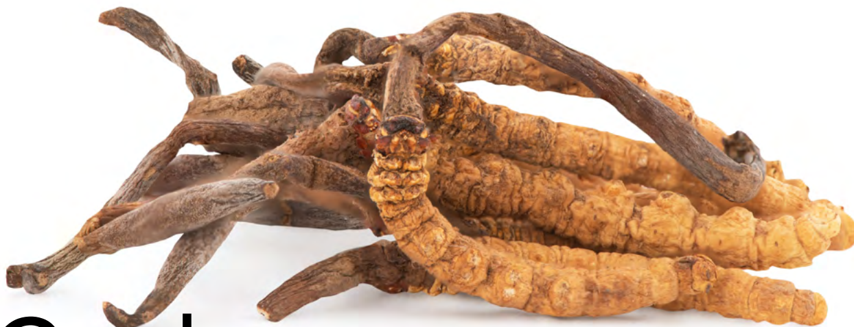
Cordyceps Ophiocordyceps sinensis .