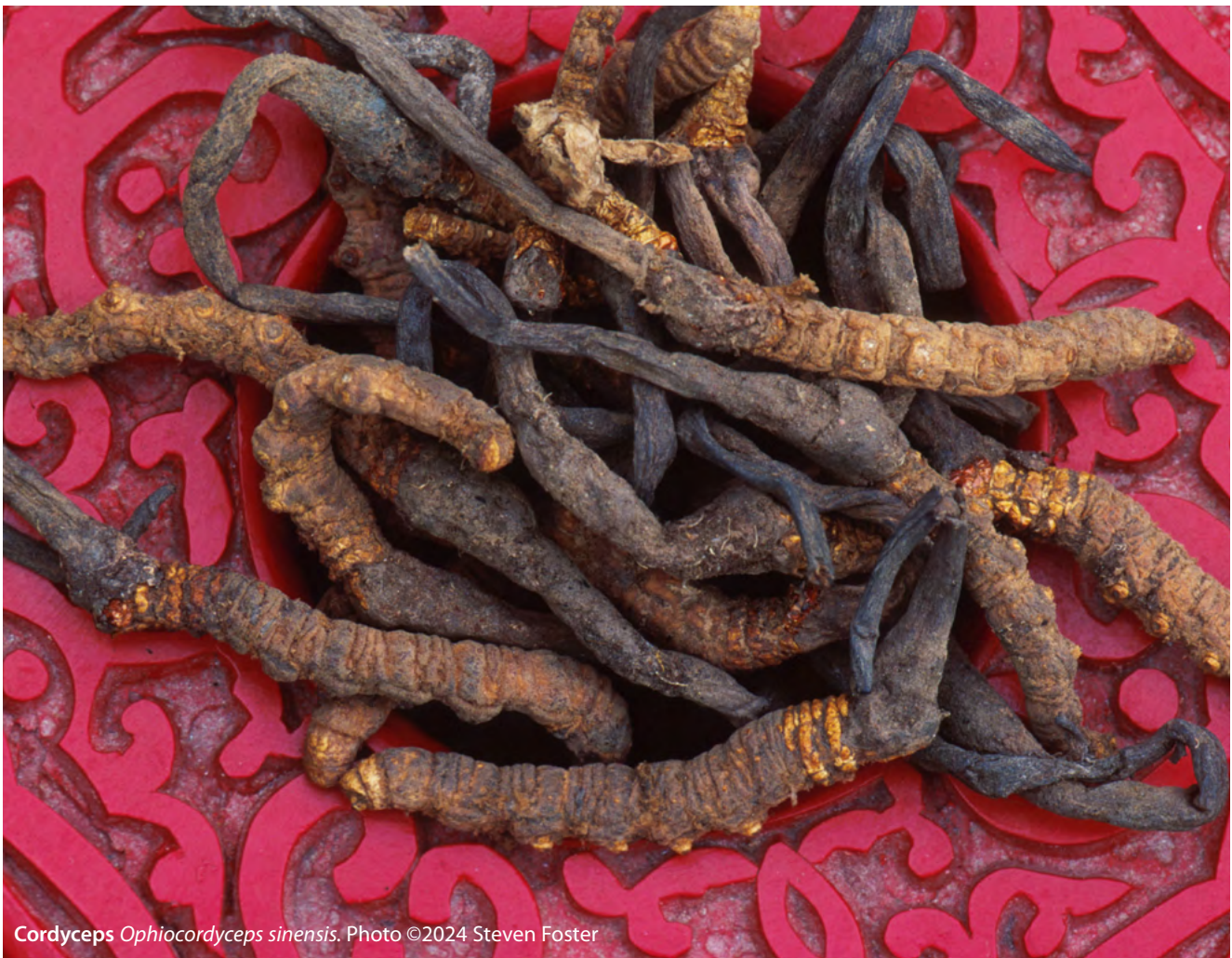
Cordyceps Ophiocordyceps sinensis .

4.3 Identification based on chemical marker compounds or chemical fingerprints: In addition to DNA analysis, chemical testing is essential for determining the relative quality of any cordyceps sample. Studies have shown that nucleosides, notably adenosine and related derivatives, are important bioactive constituents in cordyceps, as typified by cordycepin, 111-114 and these are the most widely used chemical markers for identification. However, O. sinensis has been shown in some studies to be devoid of cordycepin, 115,116 but it is found in abundance in C. militaris 117,118 and even T. inflatum . 119 High-performance liquid chromatography (HPLC) or high-performance thin-layer chromatography (HPTLC), 120-123 nuclear magnetic resonance (NMR), 124 and capillary electrophoresis 125-127 methodologies can show quantitatively or semi-quantitatively the level of cordycepin and other marker compounds for standardization. 113,128 Adenosine is widely used in China as a quality marker, and quantification methods are available in the Chinese Pharmacopoeia. 49 The amino acid ornithine may be a suitable marker to distinguish