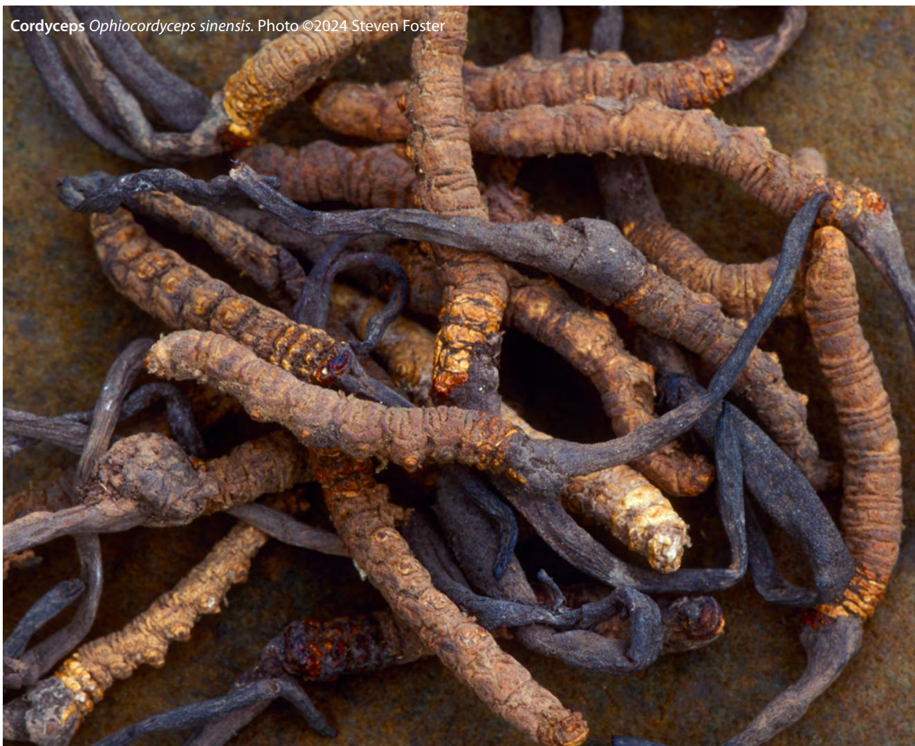
Cordyceps Ophiocordyceps sinensis .

Hobbs also investigated seven products from China and India, five products of unknown origin advertised and available on eBay or Amazon, and seven from domestic sources labeled as “ Cordyceps sinensis ” (n