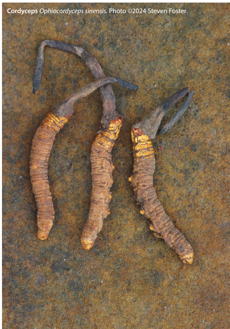
Cordyceps Ophiocordyceps sinensis .

As many as 92–118 additional species of fungi have